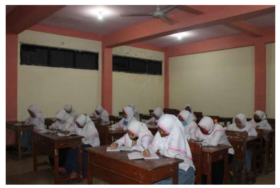
Gambar 3. Student's study in the class