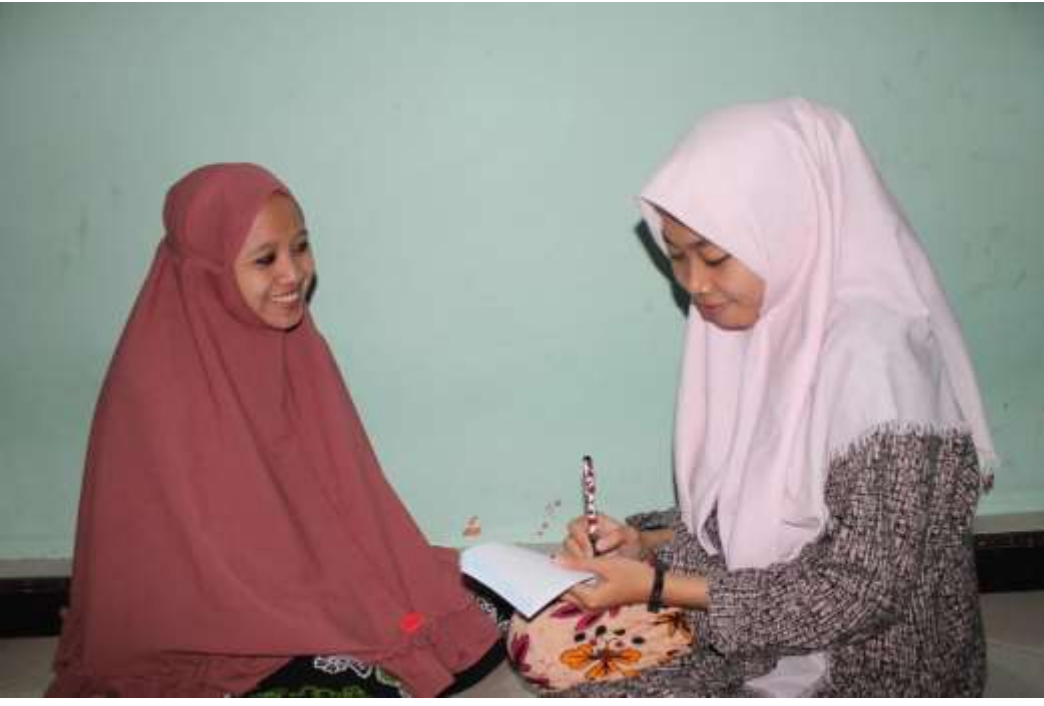
Gambar 1. Interview of the English Teacher