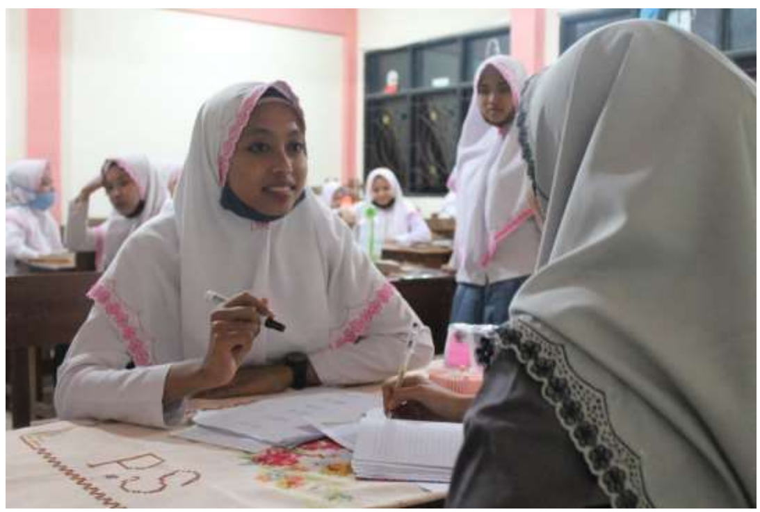
Gambar 2. Interview of the Student