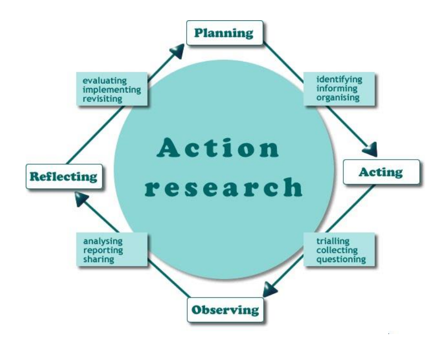
Illustration 1. Concept of Kurt Lewin Action Mode

Based on figure above, the first thing to do is a planning something before carrying out the learning process, carry out acting in the learning process, make observing on actions that have been taken in the learning process, and reflecting on the results learning so that they can do more mature planning. These four stages are repeated every cycle.