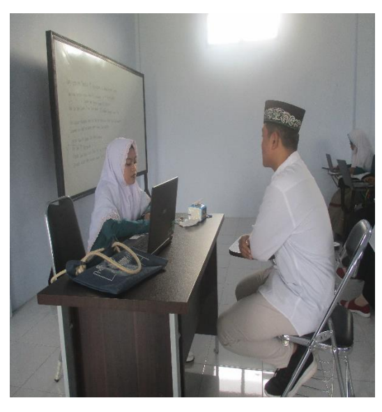
(Documentation when interviews with the Director of UPT and the student of TBIN class)