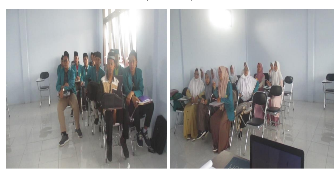
(Documentations the condition in class TBIN)